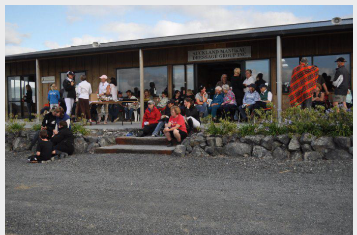
Crowd watching from the front of office block.