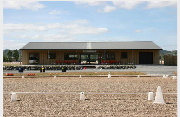
Cushionride arena with office block in background. Second cushionride arena behind office.